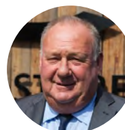
Goldenfields Water Board Member for Narrandera Shire Council

Contract divers vacuumed the inside of the reservoir, removed debris and inspected all internal water supply fittings. These works align with the Australian Drinking Water Guidelines and will assist with ongoing water quality and infrastructure maintenance.